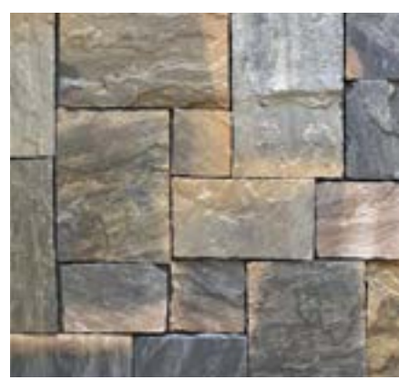
IRON ORE CASTLE STONE