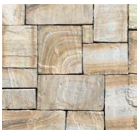
IVORY CASTLE STONE