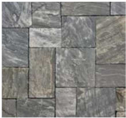
STORMCLOUD CASTLE STONE

Length: 4" - 15" Height: 4" - 15" Thickness: 0.72" - 1.12" Weight: Approximately 9-12 lbs/sq. ft.