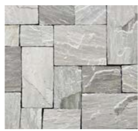
LONDON FOG CASTLE STONE