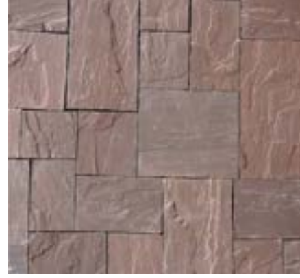
MARSALA CASTLE STONE