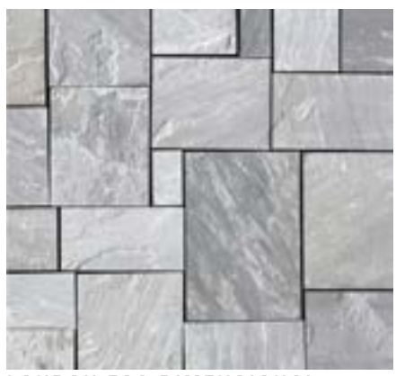
LONDON FOG DIMENSIONAL CASTLE STONE