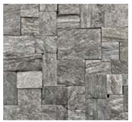
PACIFIC PEAK DIMENSIONAL ROMAN CASTLE STONE

Avaani Dimensional Roman Castle Stone is a blend of natural stone, saw-cut into various sized square and rectangular pieces. Tumbled to give a softer, slightly pitted surface with slightly rounded edges and corners. Suitable for both dry-stack and grouted applications.