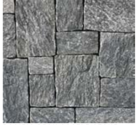
PACIFIC PEAK CASTLE STONE