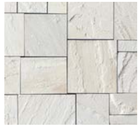
ASPEN DIMENSIONAL CASTLE STONE

Avaani Dimensional Castle Stone is a blend of natural stone artistically saw-cut into square and rectangular blocks for uniformity. This modern profile works well in both dry-stack and grouted applications. Stones are finished with a textured, natural face.