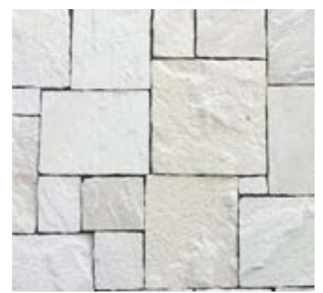
ASPEN CASTLE STONE

Avaani Castle Stone is a blend of traditional medieval-styled blocks. Tooled by hand into square and rectangular shapes, this natural stone works well for both dry-stack and grouted applications. Stones are finished with a textured, natural face.