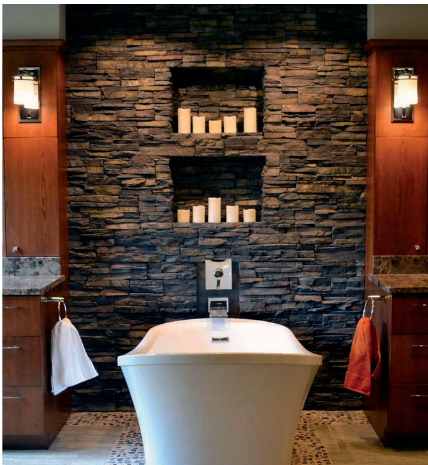
STACKED STONE CONNECT IN BLACK RIVER®