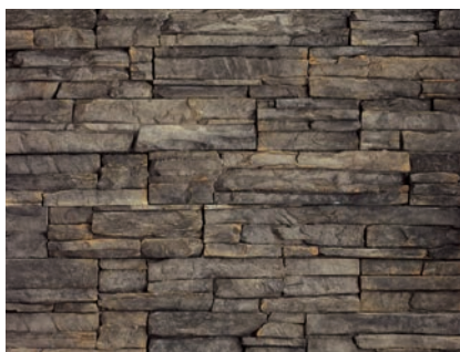
CHAPEL HILL® STACKED STONE CONNECT