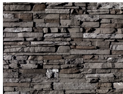
DARK RUNDLE® STACKED STONE CONNECT