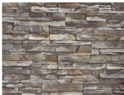
NANTUCKET STACKED STONE CONNECT