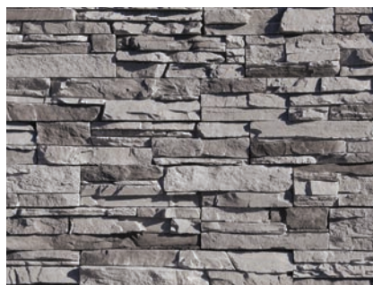
SILVER LINING STACKED STONE CONNECT