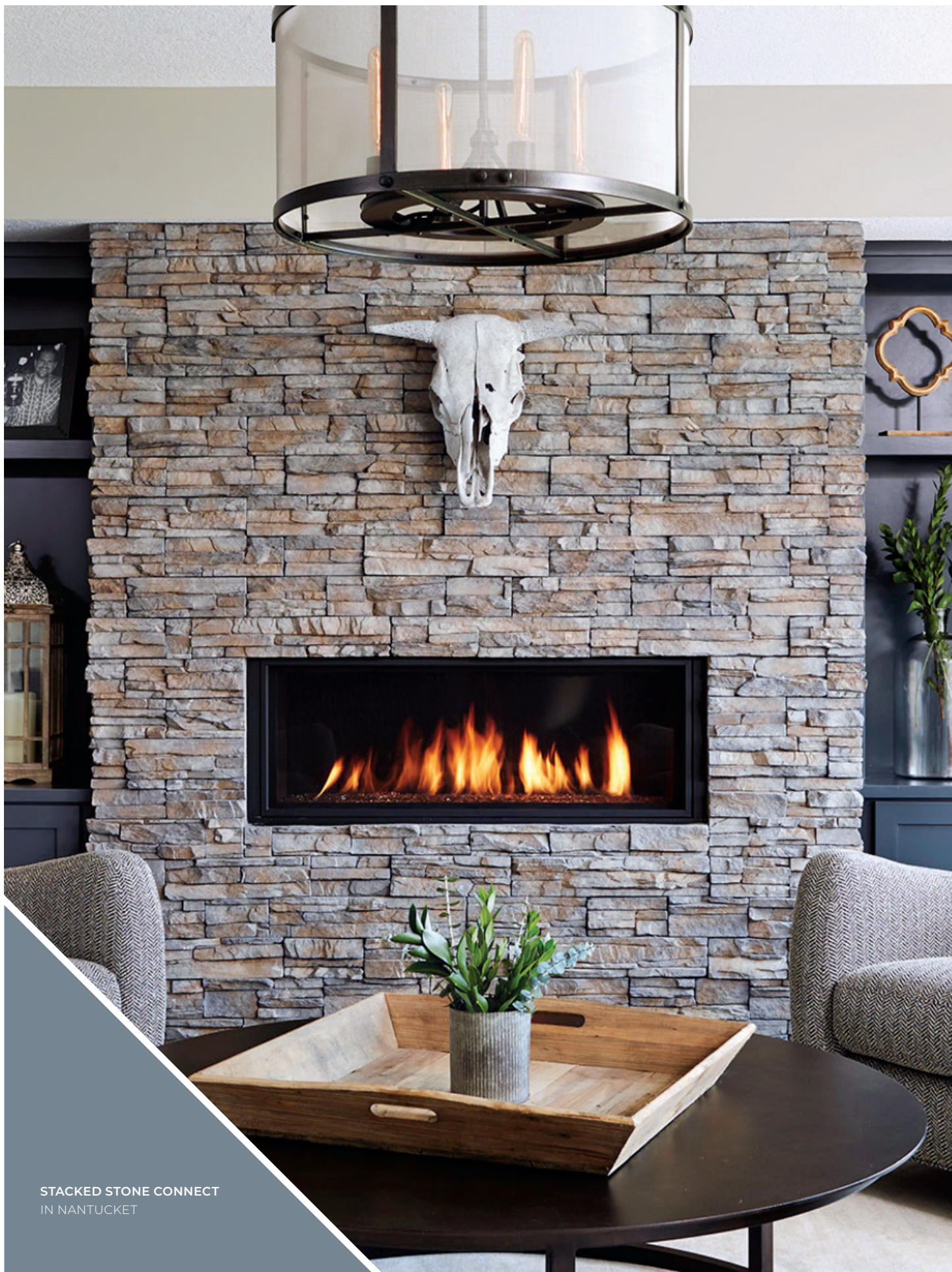
STACKED STONE CONNECT IN NANTUCKET