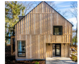
mixed shade result