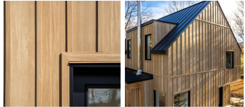
REVERSE BOARD AND BATTEN (RBB)