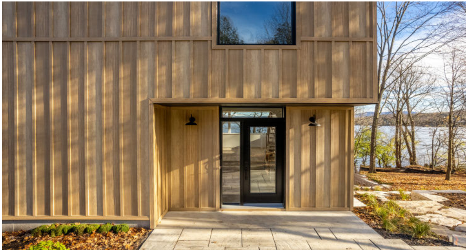
BOARD AND BATTEN (BB)

Prefinished Steel Wall Profile Without Visible Screws