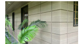
mixed shade result