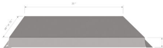
Panel 20 x 48 x 1 in Panel 20 x 72 x 1 in