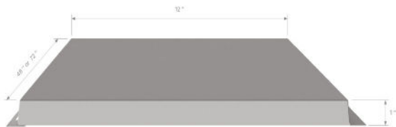
Panel 12 x 48 x 1 in Panel 12 x 72 x 1 in