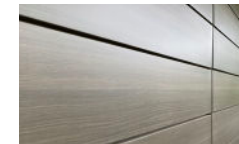
3 panels | 3 shades