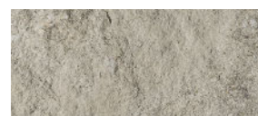
Flint Hills Mottled