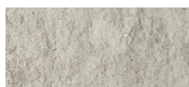
Flint Hills Gray