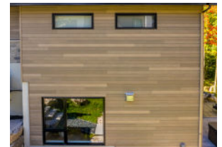
mixed shade result