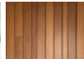
6 planks | 6 shades