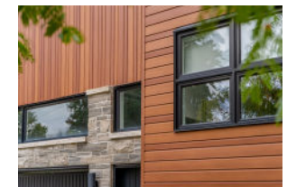
mixed shade result