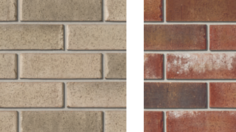
CANYON Premier Plus †