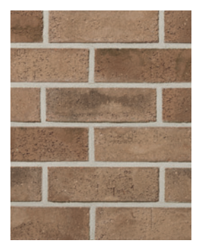
VERIDIAN Premier Plus †