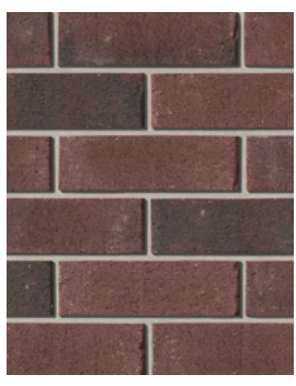
CRIMSON Premier Plus †