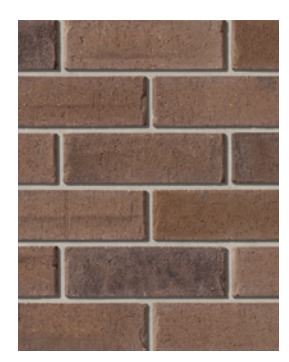
MADISON COUNTY Premier Plus †