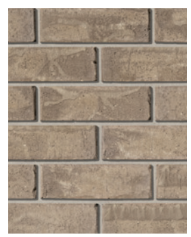
WESTMONT Premier Plus †