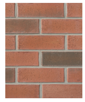
OLD SCHOOL Premier Plus