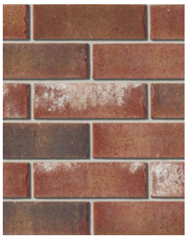
CHURCH HILL Premier Plus †