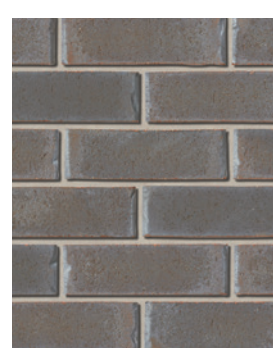
CRYSTAL GRAY Premier Plus †