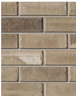
MANCHESTER Premier Plus †