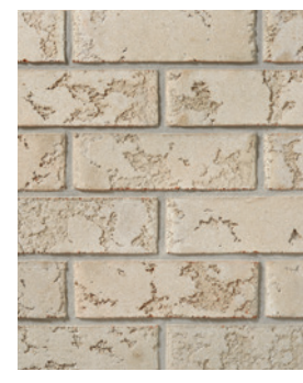
STERLING GRAY Premier Plus †